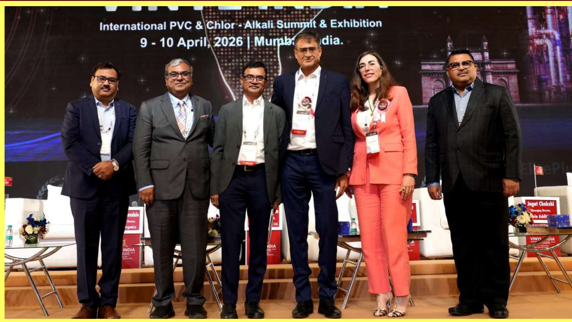
Panel Discussion 2: "OPVC at Scale – Redefining Pressure Pipe Performance in India" CEO, Dow India | ED, Oriplast | CEO, Chemfab Alkalis | BD and Director, Molecor Tecnologia, Spain | Sr. V.P., Kabra Extrusiontechnik | GM, The Supreme Industries