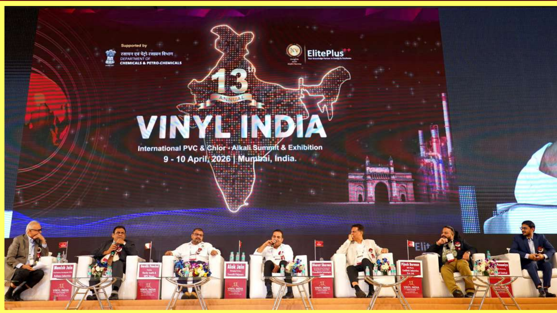
Panel Discussion 4: “Reinventing PVC – Advanced Applications for Excelling PVC Performance” Director, Jyoti World | Head BD, CPVC, Reliance Industries | Founder, Hardy Smith & WPC News | Managing Partner, Swastik Polymers | VP, BD & MD, Corporate Entities, KraussMaffei Technologies GmbH | GM(Plant), Cooldeck Inds. | Head - Product Marketing, R R Kabel