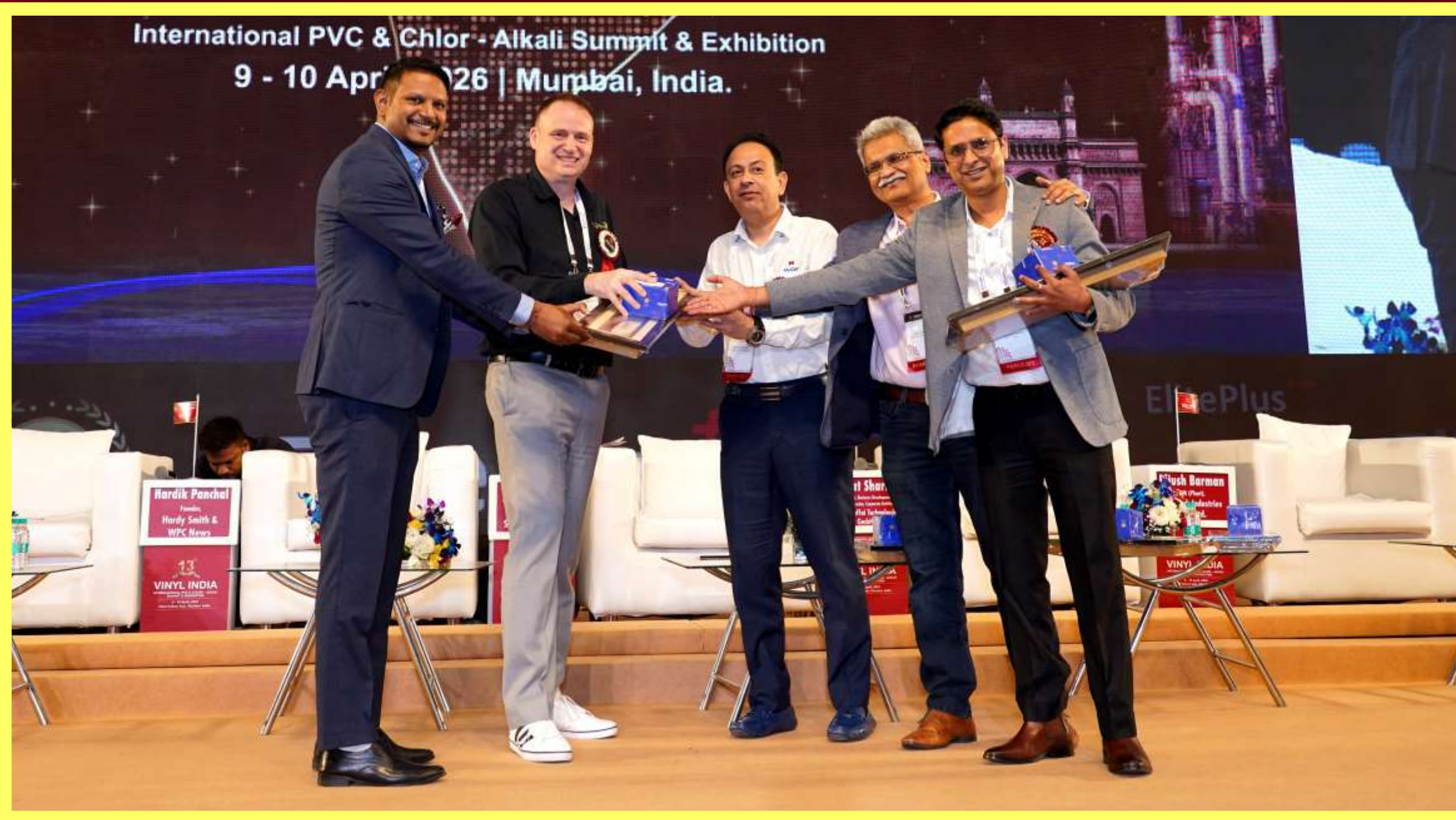
Panel Discussion 3: "Hardware - the Backbone of uPVC Window Performance" MD, Lingel Windows and Doors Technologies, Germany | Founder, McCoy & WFM Media | Director, DNV Global | MD, SIEGENIA India | Founder & Director, PEGO Hardware