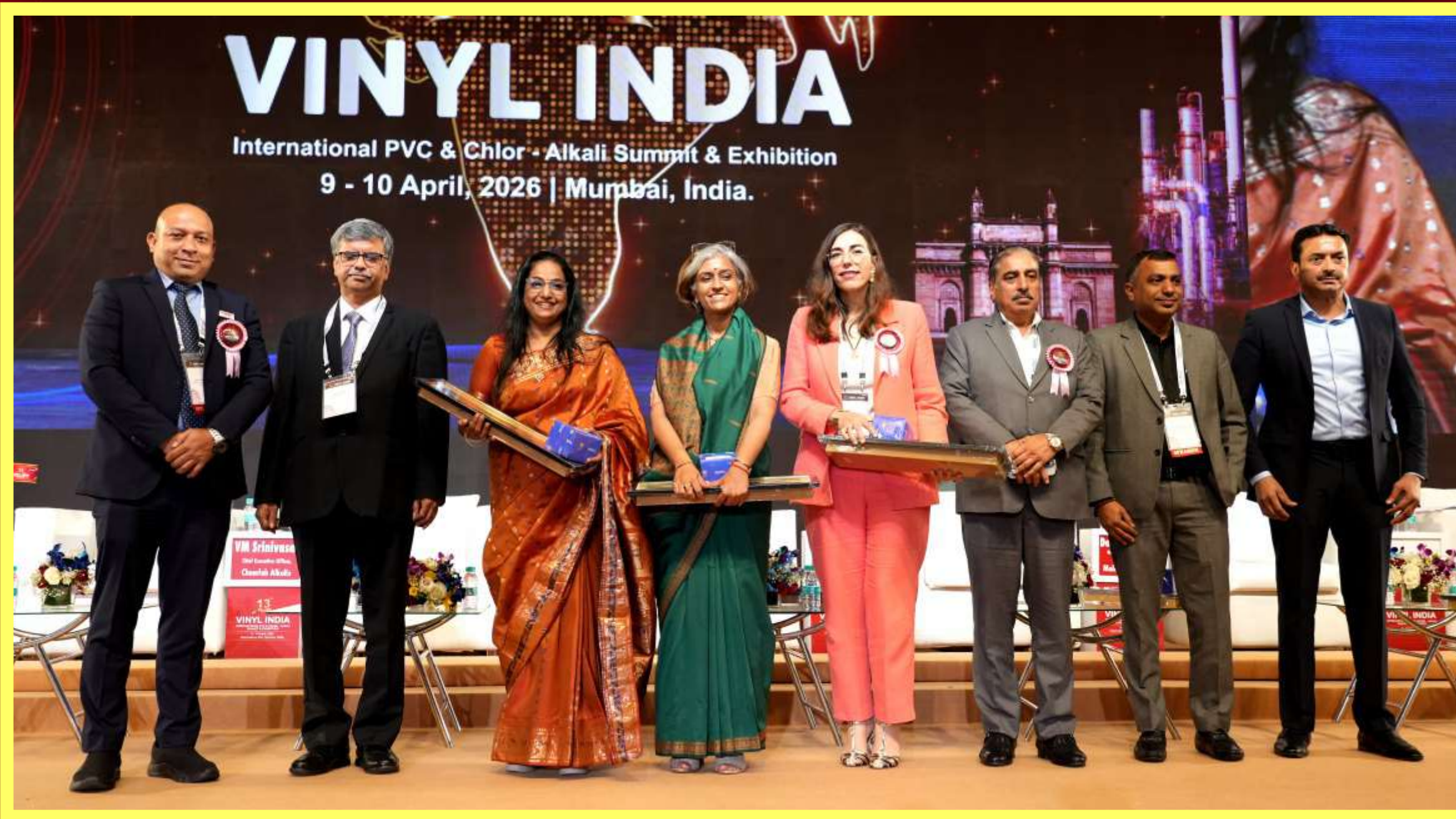
Business Session 7: "Innovations in Applications & Machinery - Solutions for the Future" GM, Reliance Industries | CEO, Rajoo Bausano Extrusions | Director, Sai Machine Tools | CMD, Dhabriya Polywood | Promoter, JamunJar | BD and Director, Molecor Tecnologia, Spain | MD, Veka