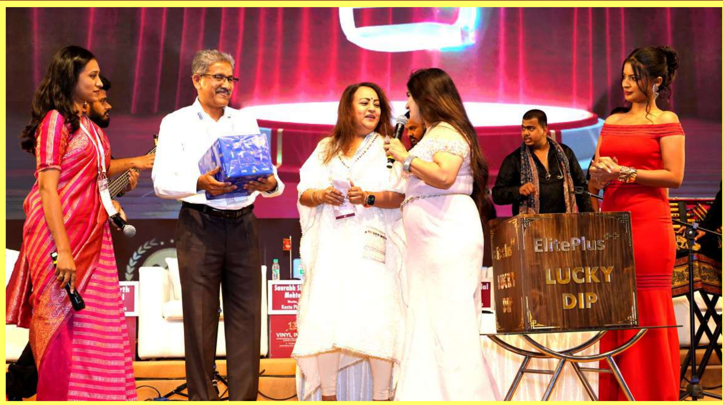
Lucky Dip Winners