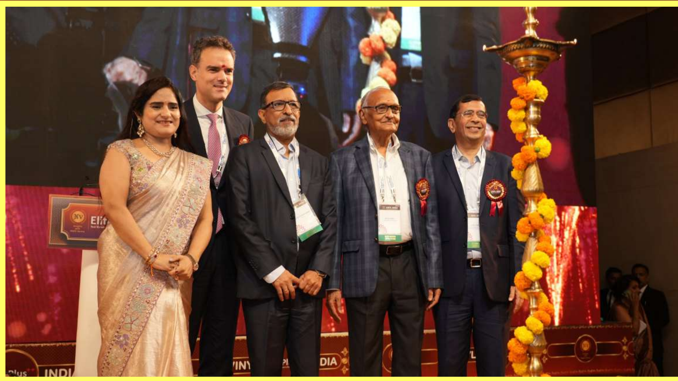
Inaugural Ceremony & Keynote Addresses by Global Industry Leaders & Policy Makers CMD, The Supreme Industries | Vice Chairman & CEO, Jain Irrigation Systems | Chief Economist, CRISIL | Partner & Leader – Petrochem, McKinsey & Company, Turkey